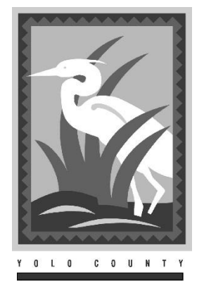
FLOOD CONTROL & WATER CONSERVATION DISTRICT